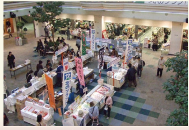
Northern Brand Fair 北国知名品牌物产展会

除了和札幌市一起前往海外开展札幌旅游的促销活动以外,还开设了"观光义务解说员协会",为到访札幌的旅客提供导游服务。