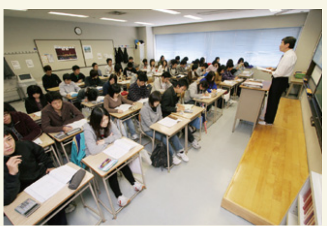
Chamber Academy 附属专门学校