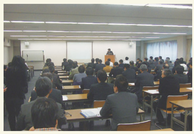
Divisional seminar 部会讲座

邀请各行业的专家授课,为会员企业提供经济动向以及各行业的前景等最新的信息。这些讲座已经成为了向会员企业提供有益的商务信息的有效平台。