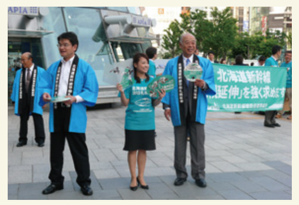
Activities to attract the Shinkansen 新干线招致活动

通过向国家、北海道政府以及札幌市请愿,不仅支撑了札幌及其近郊的产业界发展,还加快了地区社会基础的改造。