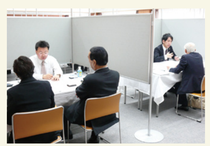
Management consulting meeting 经营咨询会

负责商务学校"札幌商工会议所附属专门学校"的经营,培养优秀人才,每年都为地域社会输送数百名毕业生。